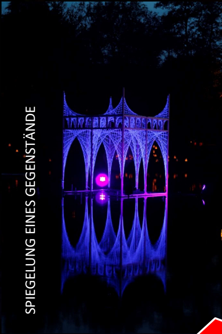
SPIEGELUNG EINES GEGENSTÄNDE

Other installations build @ various lightfestivals based on the modular installation 'ARCHEStextures - 007DFF'